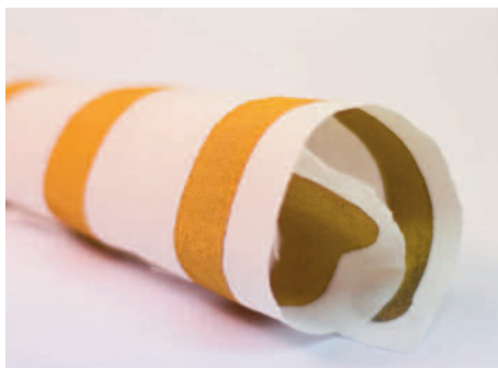
Printing on textile, and gold plating afterwards

TNO is currently using Vipem (Vipem Hackert GmbH) and CIT (Conductive Inkjet Technology Ltd.) seed inks in this project that is a spin-off from Flextronic, a European FP6 project. The process is additive and flexible, in contrast to traditional production processes that require masks, stamps, multiple production steps and based on removing instead of applying copper.