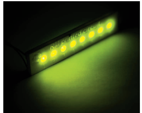
LED's soldered on a printed Laser Sintered part with printed conductive tracks