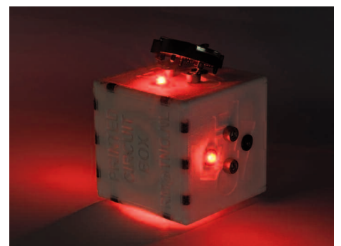
The flat part with the conductive tracks on it folded to a box

By making use of existing RM technology, Laser Sintering, with inkjet printing technology, conductive tracks can be printed onto laser sintered, thermoplastic substrates to produce high resolution, mass customisable conductive copper tracks for use in 3D MID technology.