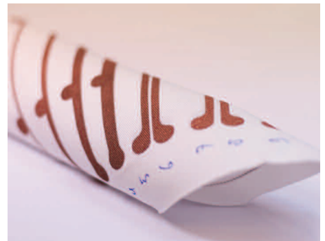
Printing on textile