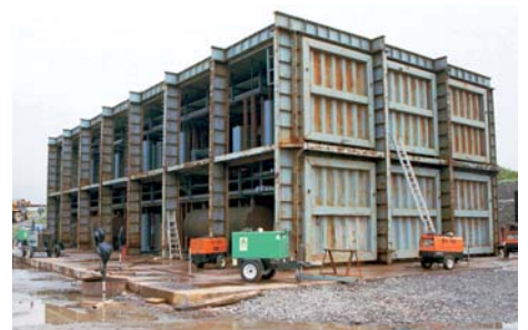
Full scale test set-up of an off-shore platform.

The tests are performed in compliance with accepted international standards.