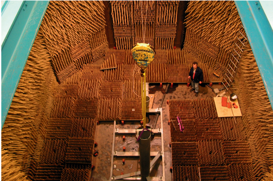
At TNO The Hague a large (8x10x8m) anechoic basin that is ideally suited for a large variety of underwater measurements is available