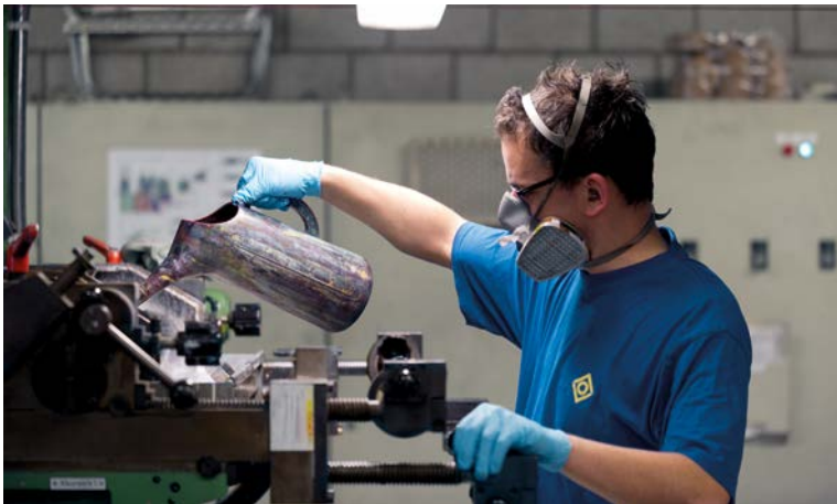
LOCATION: Oerlemans Plastics BV

Safe working practices with hazardous substances receive less attention than they deserve in the debate on sustainable employment. The urgent need for as many companies as possible to translate information from Stoffenmanager® into systematic substances policy has prompted TNO to initiate the 'Stoffenmanager implementation workshop' project. Our partners are Arbo Unie and Beco, as well as the Dutch Federation of Rubber and Plastics Industry and the Dutch Association of the Paint and Printing Ink Industry. This project supports