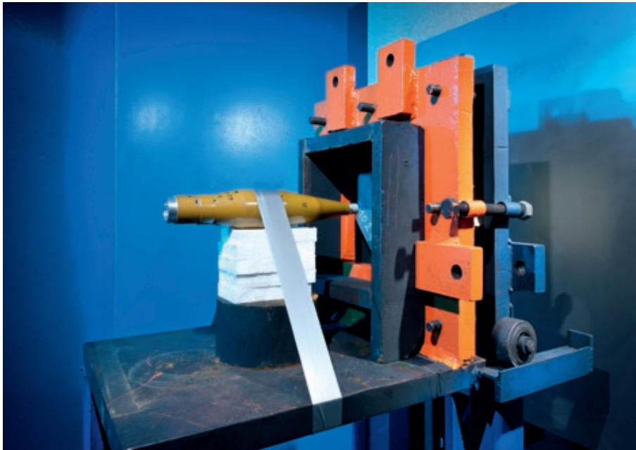
Spall liner setup with armour and shaped charge