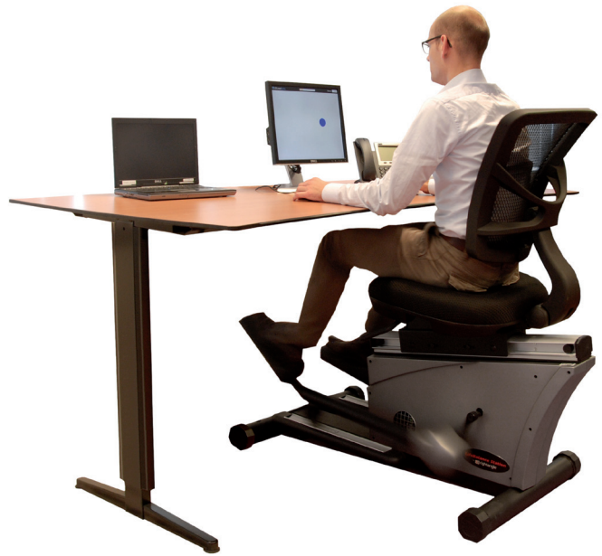
The semi-recumbent elliptical trainer workstation (RET)

relatively high discomfort that most subjects experienced in the buttocks, caused by the saddle of the bicycle ergometer. Local perceived discomfort during working on treadmill and elliptical trainer did not increase compared to sitting. The results of the questionnaire on comfort show that subjects felt physically more tired after using the elliptical trainer and the bicycle workstation (both intensities) compared to sitting. They also felt less comfortable while working on treadmill, elliptical trainer, and bicycle workstation compared to sitting. The sitting and standing condition were rated more comfortable. Almost none of the subjects experienced back pain or joint pain due to the use of the dynamic workstations.