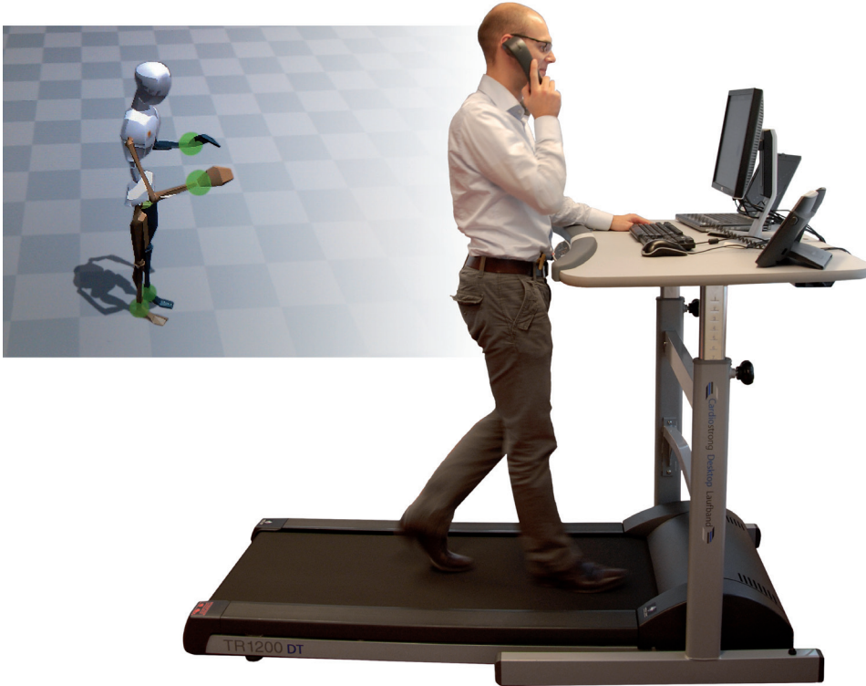
The treadmill workstation (WALK) and a screenshot of the 3D visualisation of motion capture system (Xsens)