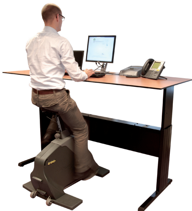
The bicycle ergometer workstation (CYC25 and CYC40)

Office workers can work on a dynamic workstation with equal performance on the most essential office tasks, high precision mouse tasks excluded. The perception of decreased performance might complicate the acceptance of a dynamic workstation, although most subjects indicate that they would use a dynamic workstation if available. Feasible exercise intensities on these dynamic workstations are not intense enough to fulfill the current guidelines on physical activity and health, except for the high (40% HRR) intensity on the bicycle workstation. However, all dynamic workstations may contribute to reduce the adverse health effects of sedentary behaviour and increase NEAT.