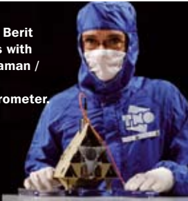
The compact Raman / LIBS spectrometer for the ExoMars mission